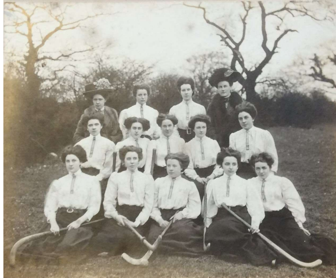
CTCC Hockey Team 1908-1910, CCTCC Archives, Unpublished data, under the care of the Family History of Cheshire, Crewe.