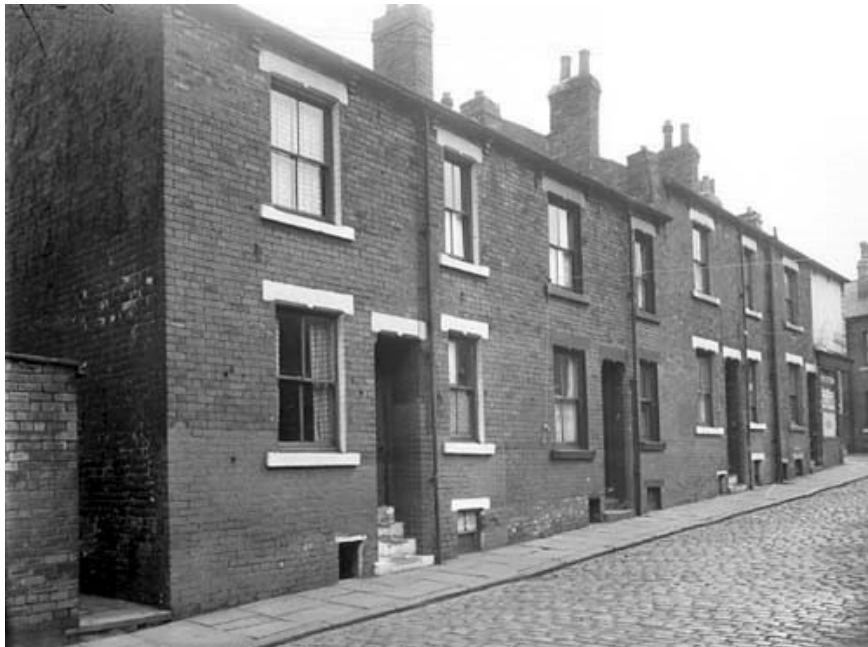
Museum Terrace Nos. 23-29